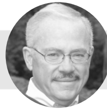
Rep. Bob Barr (R)

"For 215 years, America's Constitution and Congress have left the power to define marriage with the states, and specifically, in the hands of the people acting through their elected representatives. ... Defining marriage is a power that should be left to the states."