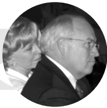
Dick & Lynne Cheney

"The constitutional amendment we are debating today strikes me as antithetical in every way to the core philosophy of Republicans. It usurps from the states a fundamental authority they have always possessed, and imposes a federal remedy for a problem that most states do not believe confronts them."