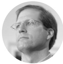
Sen. John Sununu (R)