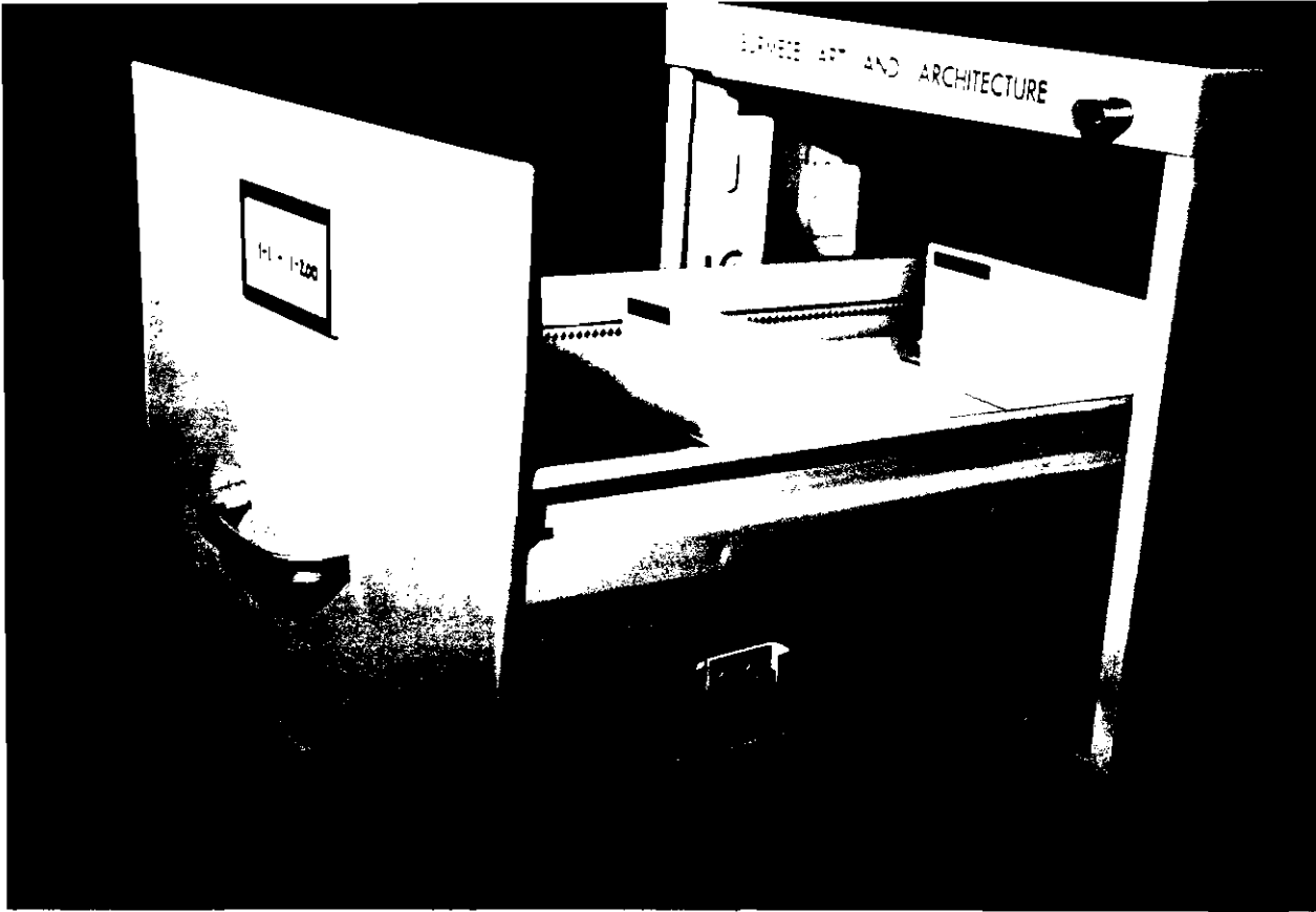
Final Storage in Steelcase cabinets.