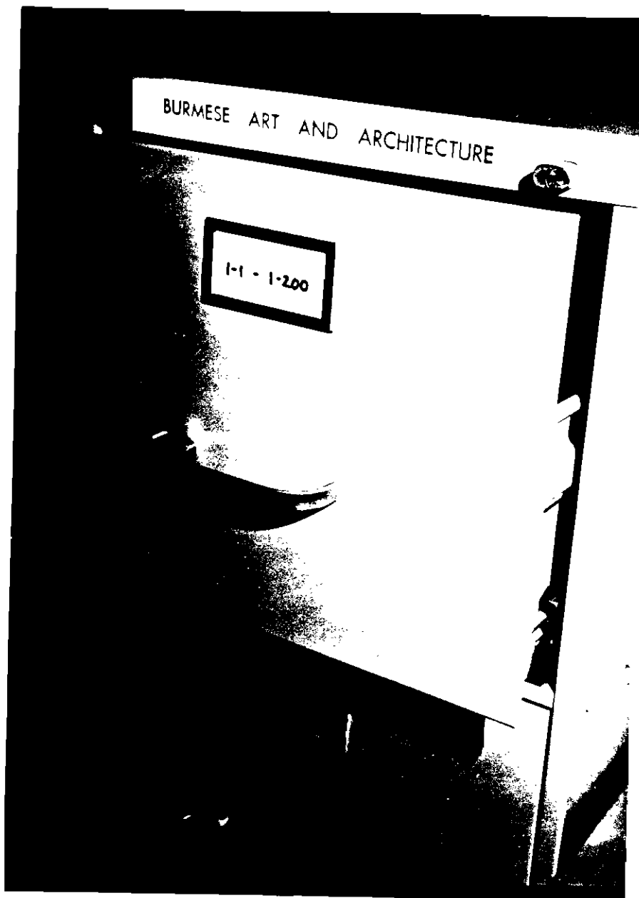
Final Storage in Steelcase cabinets.