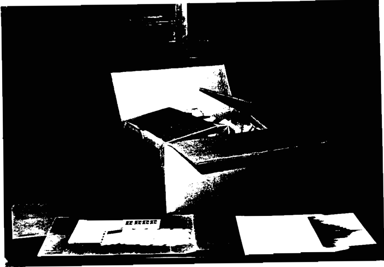
Arrival, identification, and arrangement of photographs.