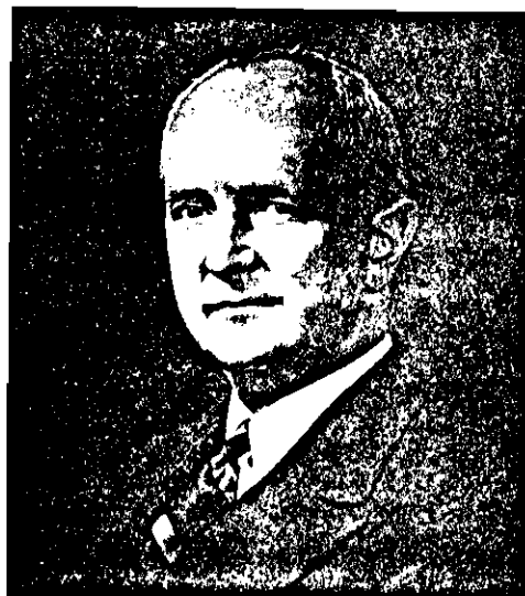
New York Times