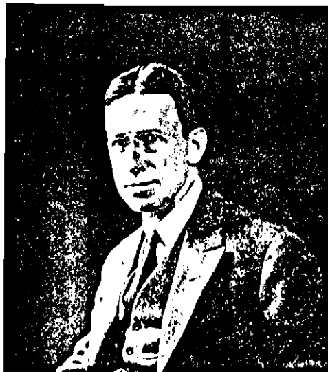
Underwood & Underwood