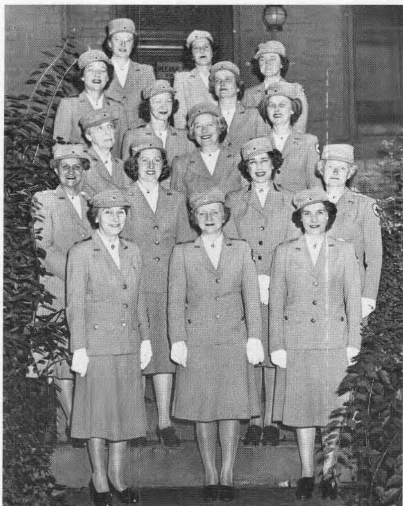
Red Cross Department Heads (CWG second row left), 1946.