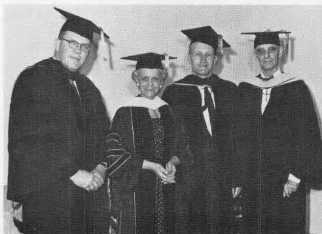
Ithaca College commencement, honorary degree, 1959.